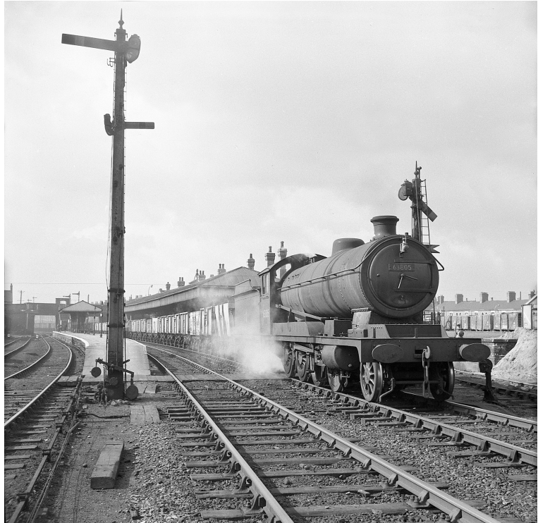
Robinson Class 04/8 2-8-0 No. 63805 at Northwich. 18th March 1961.