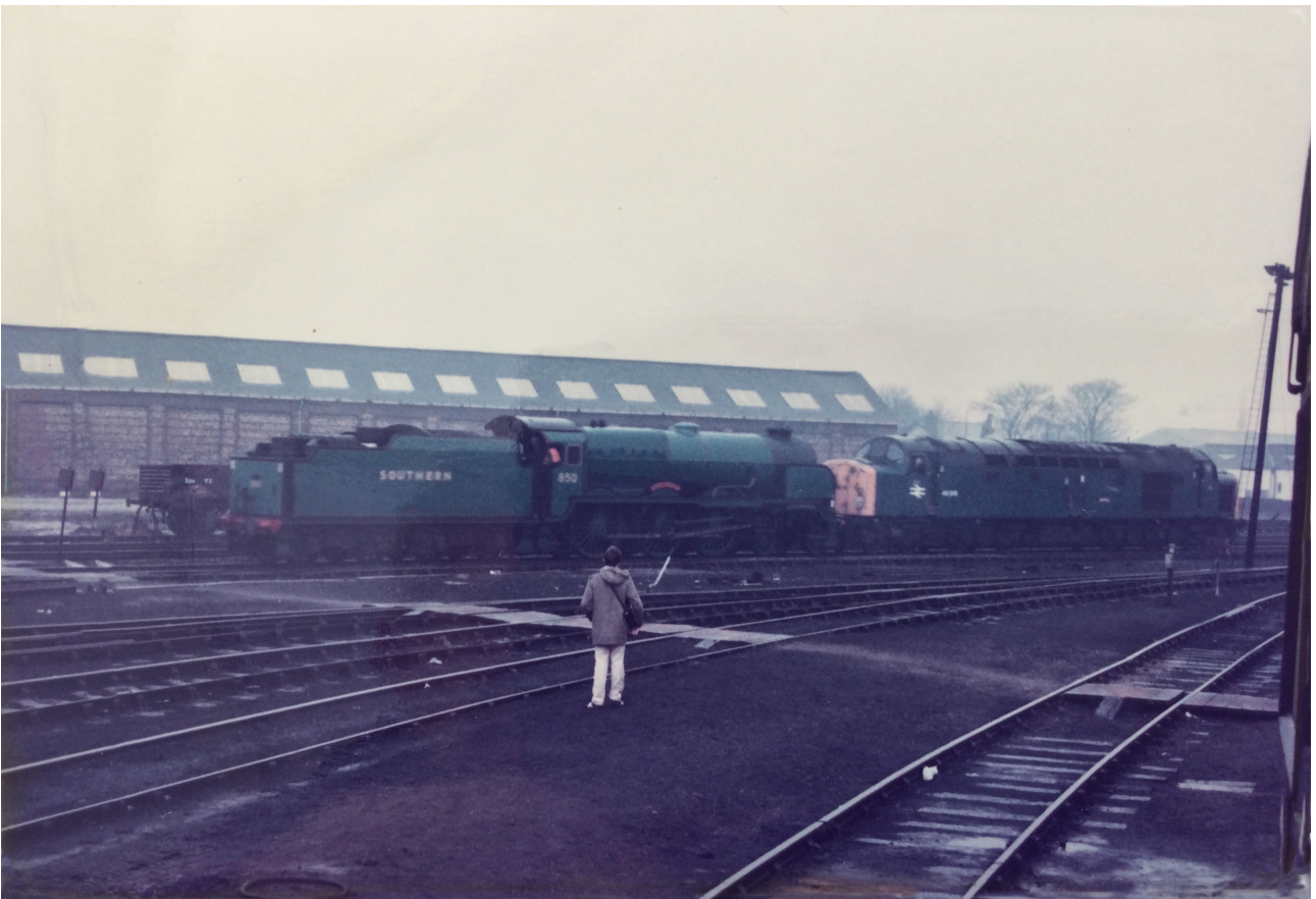
A Class 40 shunting 'Lord Nelson' at Northwich following repairs.