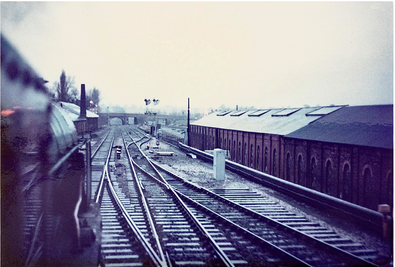
The view from the footplate of 'Lord Nelson' leaving Shrewsbury.