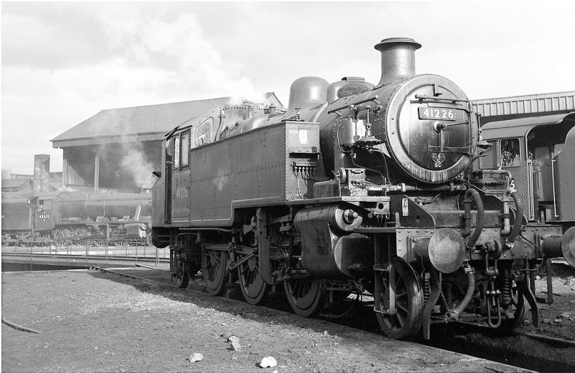
Ivatt 2-6-2T No. 41226 at Northwich. 5th April 1961.