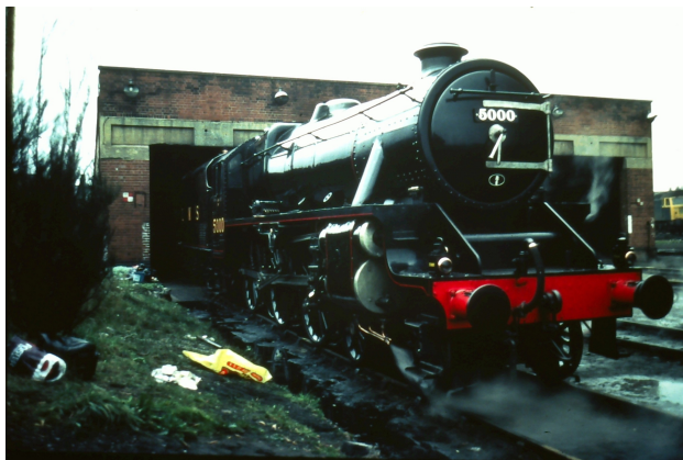
LMS 'Black Five' 5000 receives attention at Northwich on a rather damp day prior to working a 'Welsh Marches Express' from Chester later in the day.

Over the next couple of years there were regular steam visitors with locomotives coming to Northwich from Chester after working northbound Welsh Marches Express specials returning south a couple of weeks later, having been cleaned and serviced by our volunteers. Amongst these visitors were NRM's LMS 'Black Five' 5000 from the Severn Valley Railway, Southern Railway 4-6-0 850 'Lord Nelson' from Carnforth, and our most regular visitor LMS Jubilee 5690 'Leander'. All received our attention and left Northwich '8E Clean'.