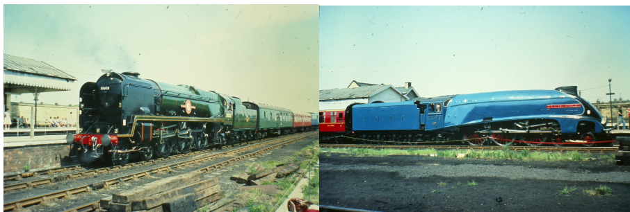
Above; Clan Line and Sir Nigel Gresley on the shuttle service Below; LMS 'Black Five' 5000 on the hoppers

assisted the train up to the sidings at ICI Winnington. The weather could not have been better with bright sunshine throughout the day and many thousands of visitors to the event, myself included as can be seen from the photographs below.