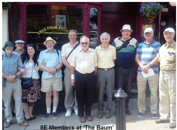
8E Members at 'The Baum'

Once again we have enjoyed some jolly times exploring the north west transport infrastructure using the marvellous value 'Wayfarer' tickets this summer, although sadly the inability of Metrolink to notify the travelling public of short notice engineering work led to significant revision to our plans on the two Saturday trips, which was rather unhelpful to say the least. Initially we enjoyed a very